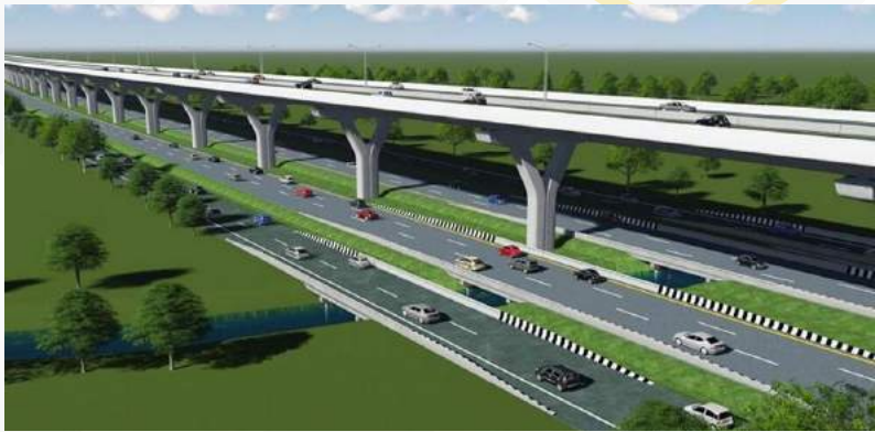
ทางยกระดับถนนทางหลวงหมายเลข 35 สาย รมบุรี-ปากท่อ (ถนนพระราม 2) ตอน ทางแยกต่างระดับ บางขุนเทียน-เอกชัย ตอน 2 จ.สมุทรสาคร ● มูลค่าโครงการ : 3,998.88 ล้านบาท