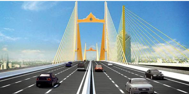
โครงการทางพิเศษสายพระราม 3-ดาวคะนอง-วงแหวนรอบนอก (สัญญาที่ 4) กรุงเทพมหานคร ● มูลค่าโครงการ : 7,943.36 ล้านบาท